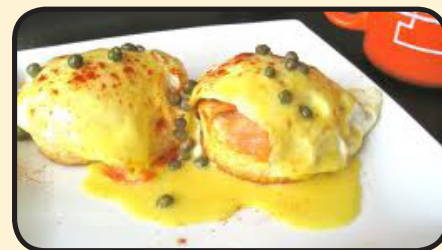
Salmon Cake Benedict

House-made salmon cakes served on a jumbo English Muffin with cage-free poached eggs, baby spinach & hollandaise. Served with home fries. 12.99