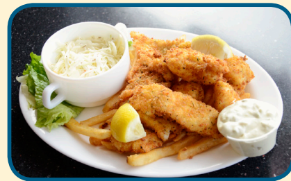
Fish and Chips

Chicken Fried Steak Hand-cut sirloin coated with seasoned flour, lightly fried till golden and topped with homemade sausage gravy. Served with red bliss mashed potatoes and chef's vegetable. 16.99