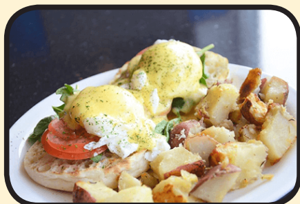
Portobello Vegetable Benedict

Jumbo toasted English muffin topped with balsamic-roasted portobello mushrooms, two poached eggs, baby Spinach, tomato and hollandaise- served with roasted red potato home fries. 9.99